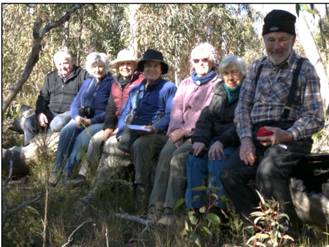
WWs taking a break on the Mulloon Fire Trail.