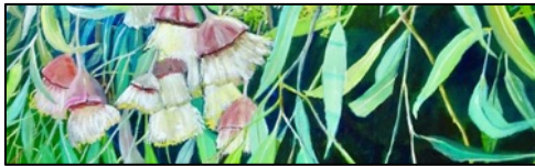
Eucalyptus kingsmillii – Mt Annan Botanic Garden