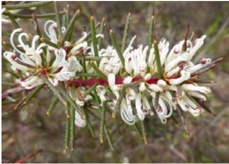
Hakea decurrens MB