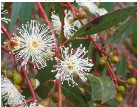
Eucalyptus rubida MB