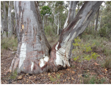
Eucalyptus rossii GRK