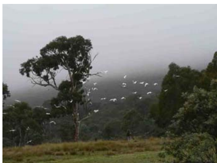
Cockies in the mist