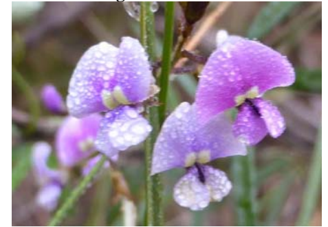
Glycine clandestina MB