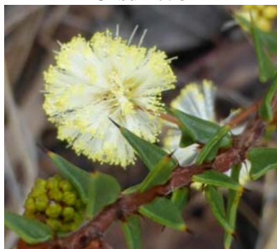
Acacia gunnii MB