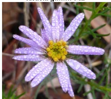
Olearia tenuifolia MB