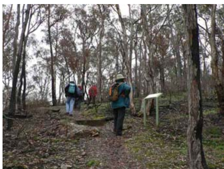
The burnt hill JG