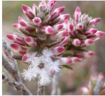
Leucopogon attenuatus MB