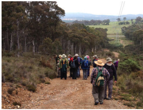
Under the powerlines GRK