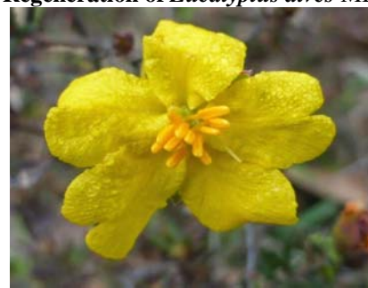
Hibbertia riparia MB