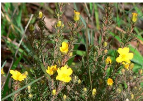
Hibbertia riparia JG