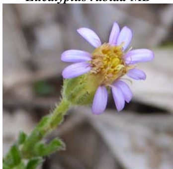
Vittadinia cuneata MB