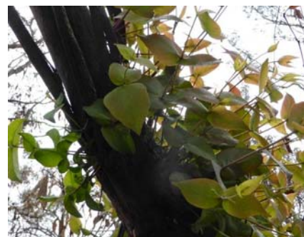
Regeneration of Eucalyptus dives MB