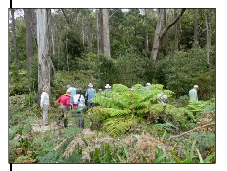
WWs - Tallaganda SF - Gum Creek Rd - Dicksonia antarctica.