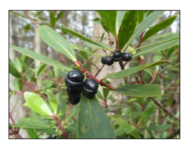
WWs - Tallaganda NP - Cowangerong Fire Trail - Tasmannia lanceolata – Native pepper bush.

*Australian Native Plants Society Australia