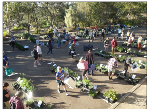
Above – At the Plant Sale. Setting up on Friday, and customers arrive at 8.30am on Saturday.