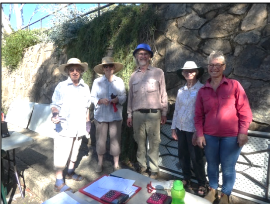
Volunteers and growers at the Plant Sale.

Reminder it is important to bring any Myrtaceae specimens into ANBG in plastic bags.