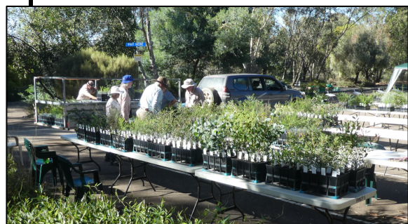
Plant sale set up - plant delivery

'If you have thoughts on a place to go with good companions and friends, please make a suggestion. I'm sure you will get takers!' Jeanette