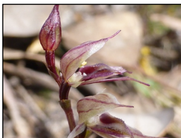
Orchids on Black Mountain - Lt - Corybas incurvus Lt - Acianthus collinus Top - Bunochilus umbrinus