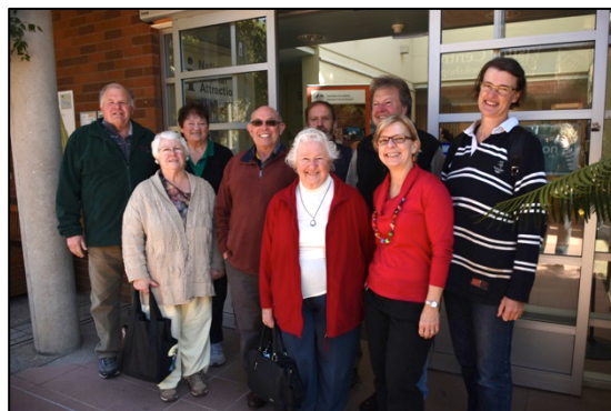
Above and below - DAGs event – visiting the ANBG botanic art collections.

A Flyer is attached to this Bulletin. Please use it to promote our Plant Sale at work, at the local shops, email around networks etc.