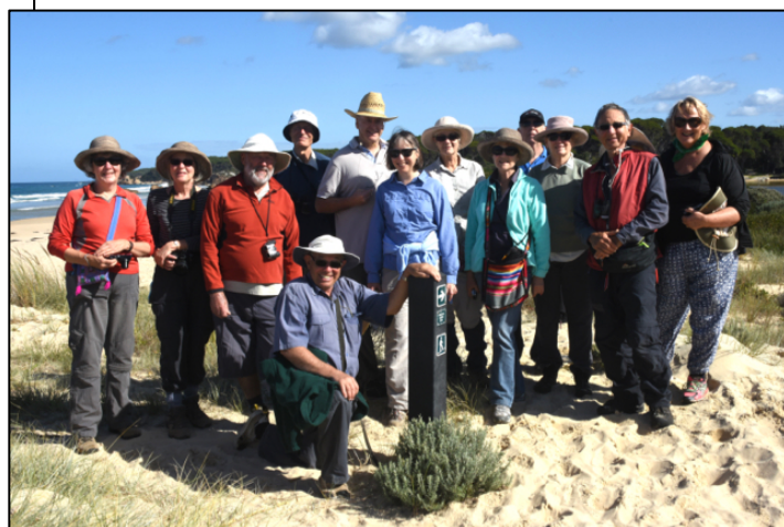
Above: Mallacoota field trip