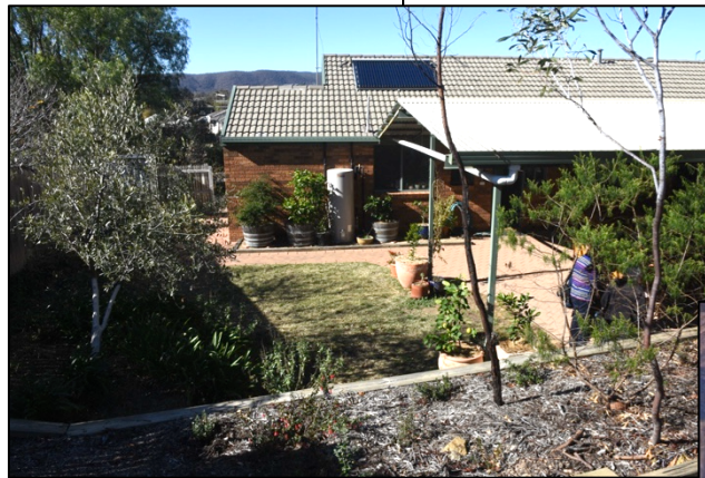
DAGs&GDSG visit to Alison and Darryl's garden in Karabar. - Alison talking to visitors Lt, view of the terraced back garden and native finger limes from the garden.