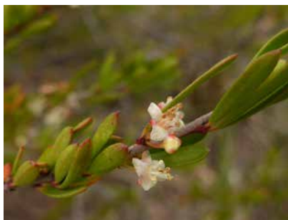
Mirbelia oxylobioides Bombay Reserve