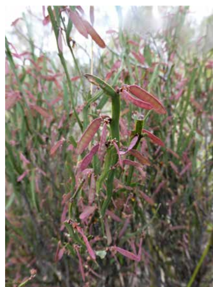
Eucalyptus rubida , Bombay Reserve