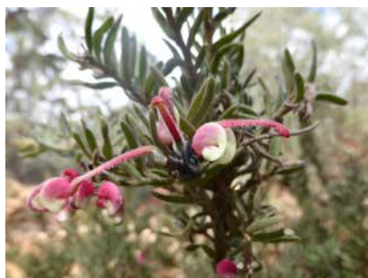
Luzula densiflora , Bombay Reserve