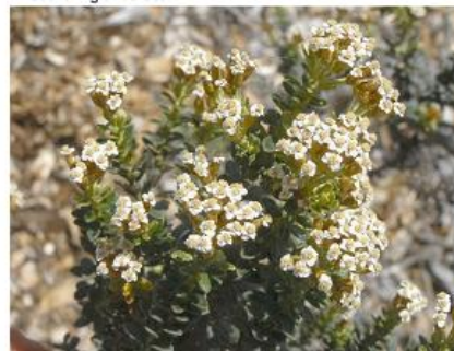
Ozothamnus ledifolius