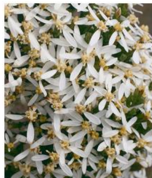
Olearia teretifolia GL

A rounded shrub with dark, narrow, green leaves, which give a conifer-like appearance to the plant. White daisy flowers cover the bush. Adapts to most soils. Prune after flowering.