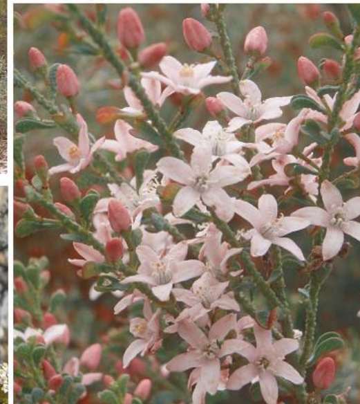
Philotheca verrucosa CH