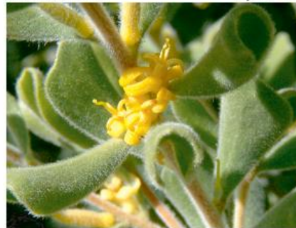
Persoonia rigida