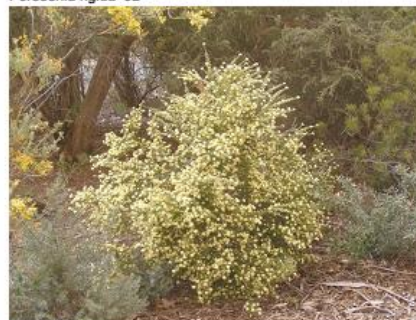
Phebalium glandulosum HB