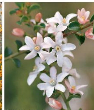
Philotheca buxifolia BE-T