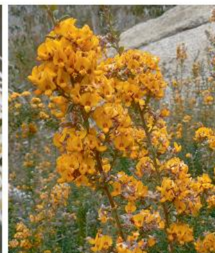
Oxylobium ellipticum JG