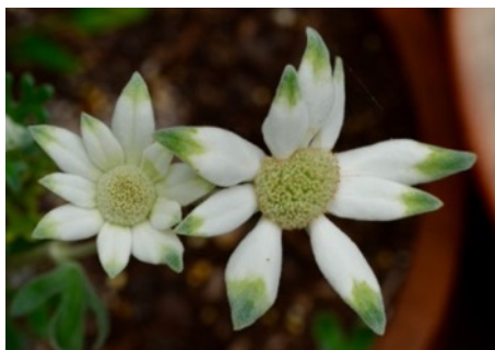
Fran's garden - Actinotus helianthe - Leptospermum sp.