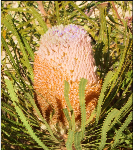
Banksia hookeriana or Hooker's Banksia has upright, slender, green toothed foliage and bright orange flowers. This plant is native to the area between Perth and Geraldton in Western Australia.