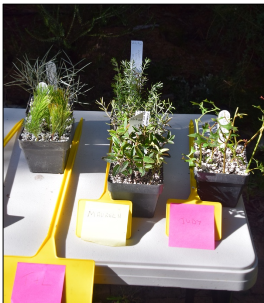
Just completed cuttings waiting to go into the hotbed