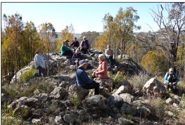
Lunchtime.