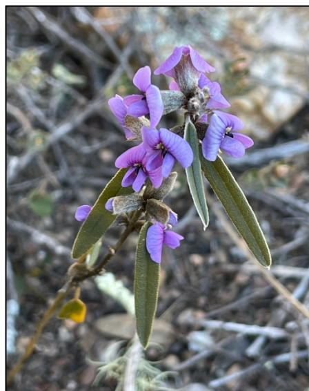
Hovea heterophylla.