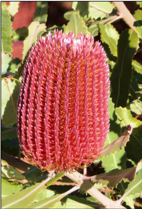
Banksia menziesii, Firewood Banksia or Menzies Banksia, is a small tree or shrub with oblong, toothed, green leaves and deep pink to red flowers. This plant is native to the west coast of Western Australia, around Perth.