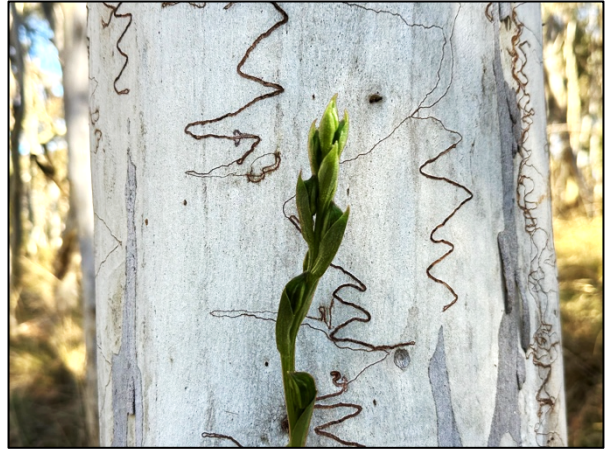
Brunochilus-Pterostylis sp in front of Eucalyptus rossii and the group.